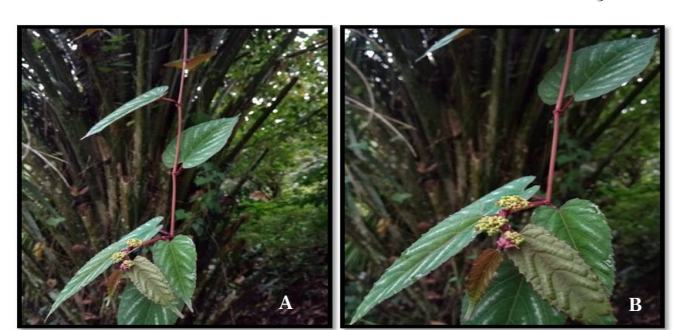
Fig. 1: A: Habit of Cissus javana and B: flowers

The genus ' Cissus ' belongs to the Vitaceae family which includes the common fruit- grapes ( Vitis vinifera ) and possess several medicinal properties which were listed in Table 1. In recent years, plants of the genus Cissus were reported to contain sterols, triterpenoids, phenolics, flavonoids, stilbene derivatives, coumarin glycosides and iridous. Many Cissus species were reported to possess antimicrobial, anti-osteoporotic, hypoglycaemic, antioxidant, antitumor, analgesic, anti-inflammatory, gastro protective, hepatoprotective, immunomodulatory and anti-allergic activities.<sup>4</sup>